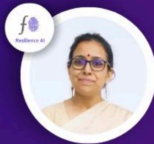
Samhita Resilience AI